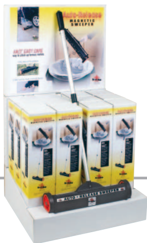
13-Unit Display MS16-13

Clean-up has just become easier with the Auto-Release Magnetic Sweeper. The sweeper's 16-inch magnetic plate attracts ferrous material and easily releases it by turning the handle counterclockwise and pulling. Back pain and bending are a thing of the past. Its innovative design is non-corrosive, easy to use and eliminates hand cuts by eliminating contact with attracted material.