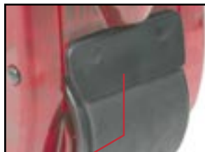
Built-In Wheel Scraper