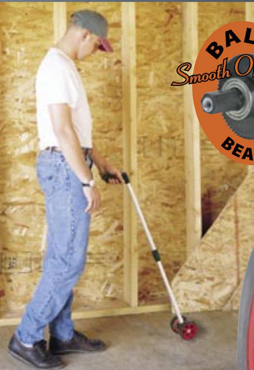
Series 12 Dual